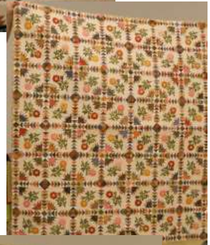
Enjoy a few samples of Lauren DeVantier's wonderful truck show. Top: Edyta Sitar Middle: Morton Masterpiece Bottom: Heartland Quilt Shop design