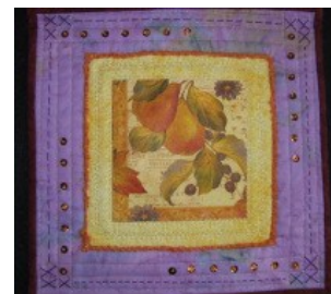
Art quilt Primer Samples