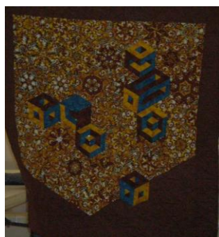
One Block Wonder