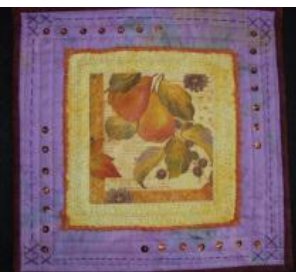
Art quilt Primer Samples